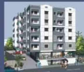
Prime's Sikharadri Towers