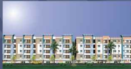
Prime Meadows Apartments