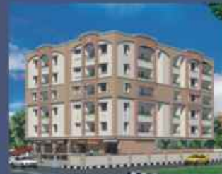
Prime's Siddhartha Towers