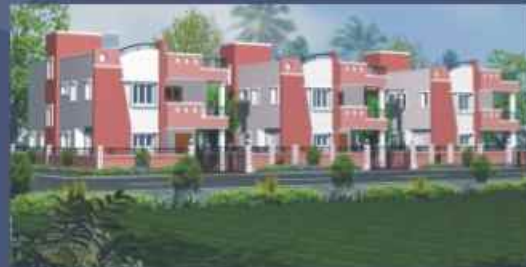
Prime Meadows Villas