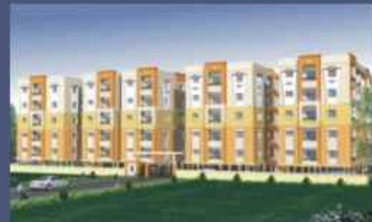
Prime's Hemadri Towers